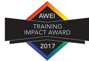
TRAINING IMPACT AWARD AUSTRALIAN FEDERAL POLICE