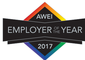
2017 EMPLOYER OF THE YEAR ANZ