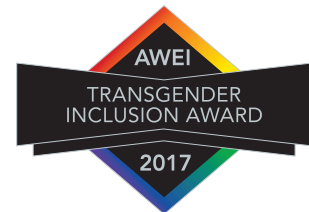
AWARD FOR THE INCLUSION OF TRANSGENDER PEOPLE ANZ