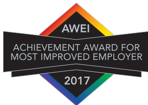
ACHIEVEMENT AWARD FOR MOST IMPROVED ENERGYAUSTRALIA