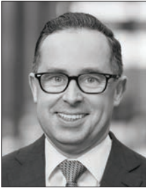
ALAN JOYCE AC CEO, QANTAS CO PATRON, PRIDE IN DIVERSITY

After another incredibly challenging 12 months in which many of us spent long periods working remotely, it's fantastic that more of us are now able to return to the workplace.